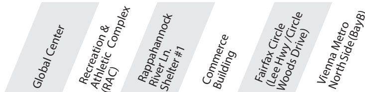
Global Center – Vienna Metro Monday – Thursday