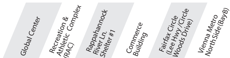
Global Center – Vienna Metro Monday – Thursday